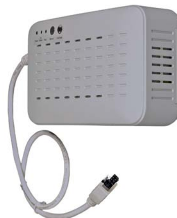
Tellabs enterprise mini Power Supply Unit (emPSU)