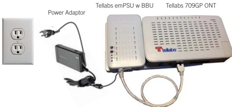
Tellabs Optical Network Terminal (709GP) with the Tellabs emPSU BBU